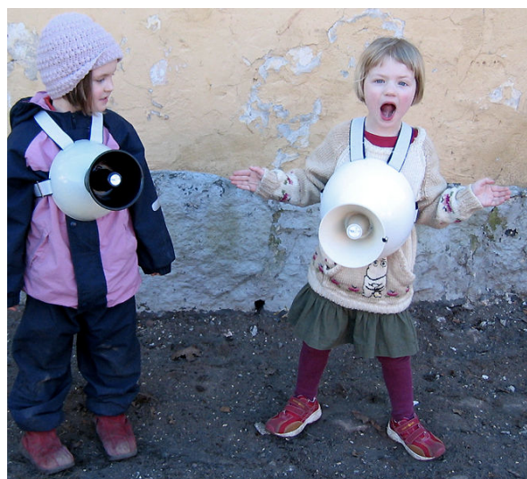
Figure 1. TRATTI visually resembles a bull horn worn around the belly.

There is a rich tradition of musical instruments in art. Some of them could be regarded as ancestors of the TRATTI. A good example of artist-created experimental sound device from western art history is for example Luigi Russolo's (1885-1947) "Noise Intoners". In 1913 Luigi Russolo wrote "The Art of Noises, Futurist Manifesto" [9]. In it he writes: "Ancient life was all silence. In the 19th Century, with the invention of machines, Noise was born." [9]. In Russolo's view the evolution of music was comparable to the multiplication of machines, which had become part of the everyday life during industrial revolution. In the following year 1914 Russolo introduced his experimental sound-making machines or 'noise-intoners', which he had built with his assistant Piatti. These noise machines can be seen as